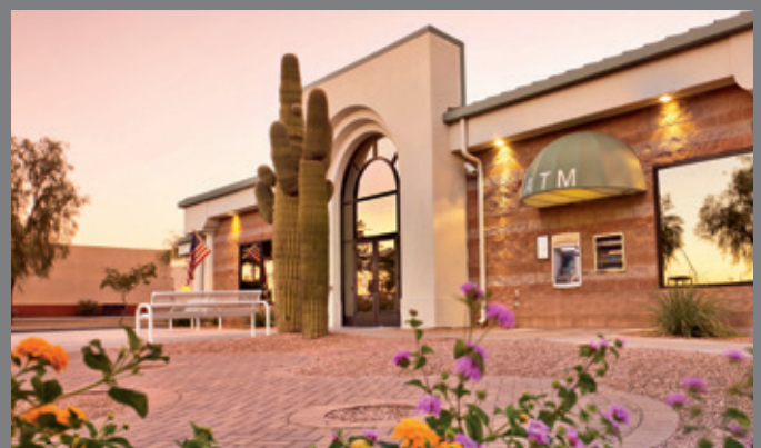
Thornydale Branch, 6510 N. Thornydale Rd., Tucson, AZ 85741

To RSVP and to stay up-to-date with details, please visit pimafederal.org/annualmeeting .