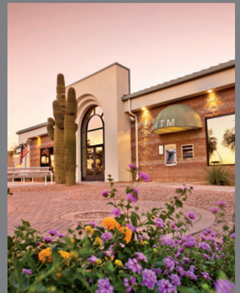
Thornydale Branch 6510 N. Thornydale Road, Tucson, AZ 85741

To RSVP and to stay up-to-date with details, please visit pimafederal.org/annualmeeting .