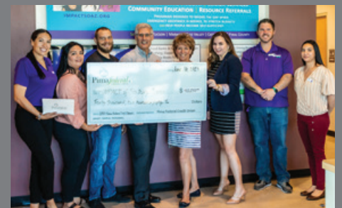
Check presentations at Youth On Their Own (top) and Impact of Southern Arizona (bottom).